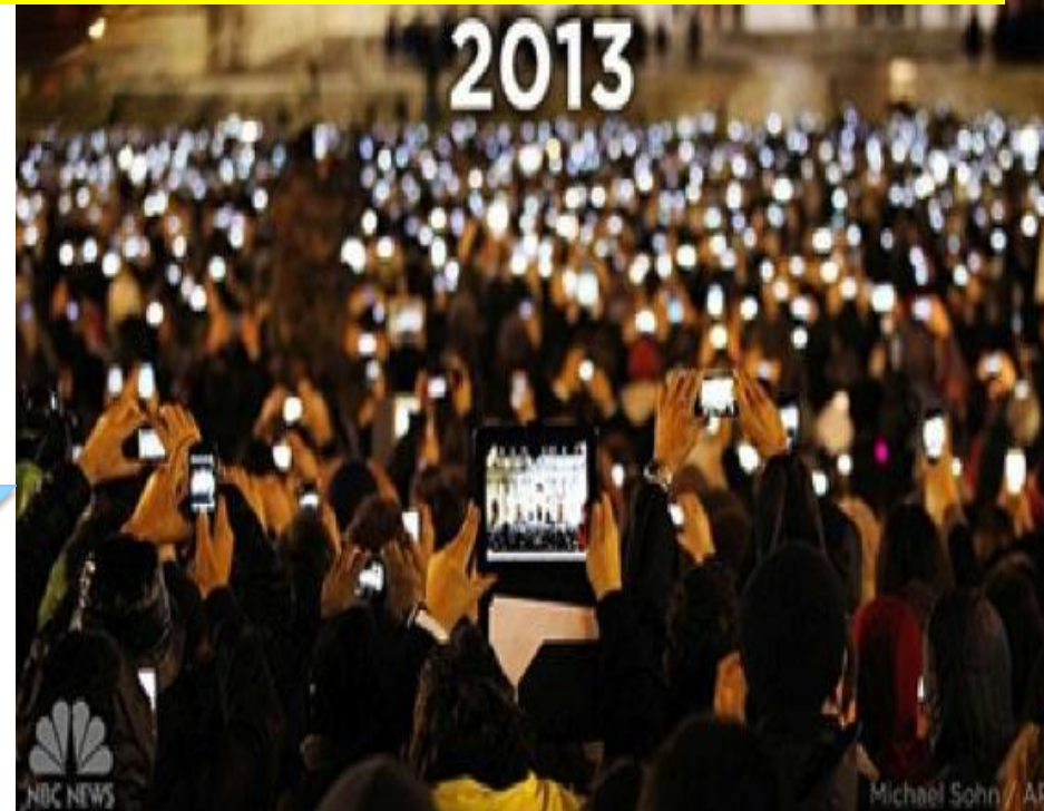
Pope Benedict's Inauguration